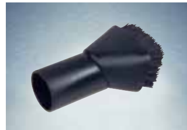
Suction brush 5146

For cleaning large sensitive areas, like desks and other furnitures.