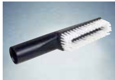
Brush nozzle 6086

For cleaning radiators and other narrow hard-to-reach areas.