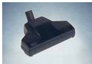
Turbine carpet suction brush 54118

2-ply filter bag in sturdy quality and high filtration rate. PU 10 pcs. The original ALTO quality.