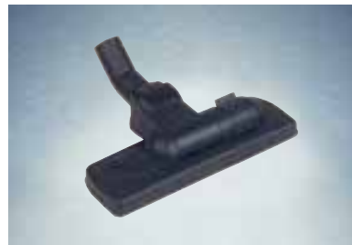
"Office" floor nozzle 302000259

For cleaning small sensitive areas, like dashboards and keyboards.