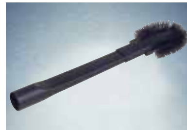
Radiator brush nozzle 5144

You should know more about the ALTO SALTIX. Please contact your local ALTO dealer.