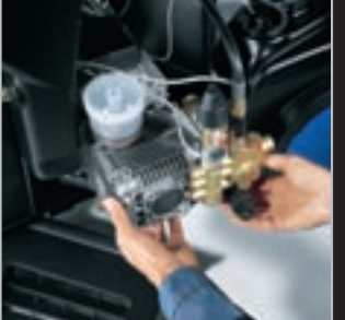
Boiler Maintenance Designed to run clean and save fuel costs, they also save maintenance costs because they are easily and quickly removed by 1 person.